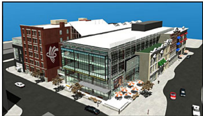
Red River College downtown campus Winnipeg, Manitoba

Red River College offers the program over a two-year period. The first year, students focus on basic software and technical writing forms. They learn Word, PowerPoint, Excel and FrameMaker. They produce manuals, newsletters, reports, and other short documents. The summer term is a co-operative work term. Students are paid for their work in a technical writing job.