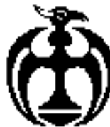
Water Bird—Symbol of Renewal